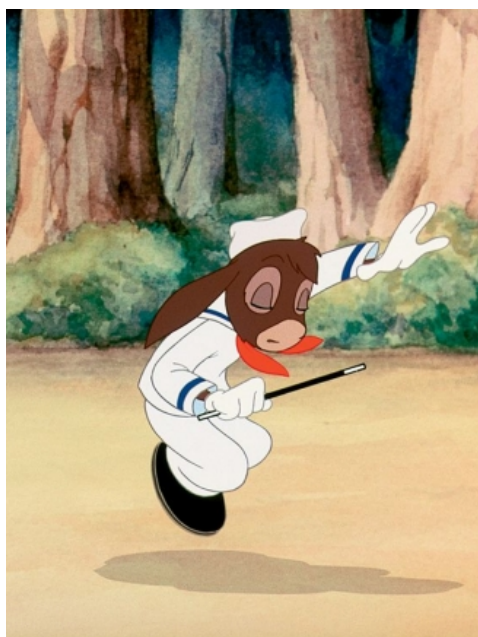
Mathias Poledna: Imitation of Life , 2013, 35mm film, 3 minutes; in the Austrian pavilion at the Venice Biennale.