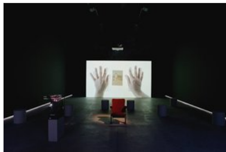
Lebanese Pavilion, installation shot.

with the exhibition itself tending to accentuate the ornamental nature of the Venetian home that housed it, as opposed to the curatorial contents themselves. It seemed that the exhibition's curator was somehow unable to 'locate' these works within the context of Venice. One could potentially argue that this was because Watkins was only invited as curator a matter of months before the exhibition opened, as it was former Liverpool Biennial Curator Lorenzo Fusi who was initially invited to curate the Iraqi pavilion at Venice.